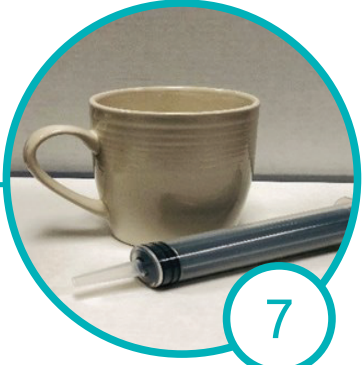
Flush After Disconnecting