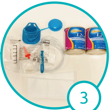
Gather Supplies: Bag, Formula, Wash Cloths