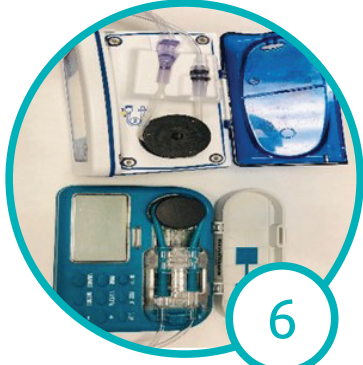
Pump Operation: Prime Tubing (Make Sure Patient is not connected) Enter Correct Setting (Connect to Patient)