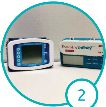
Type of Pumps: Joey vs Infinity